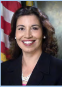
Anna Escobedo Cabral United States Treasurer